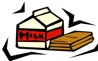
Plan Healthy Snacks!

♥ Include your children in family meal planning. Make it fun. Let them choose a different color vegetable for each day of the week, or choose one day where they can select their favorite fruit for dessert.